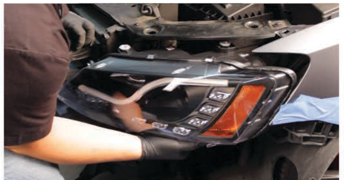
16) Seat the Spyder headlight.