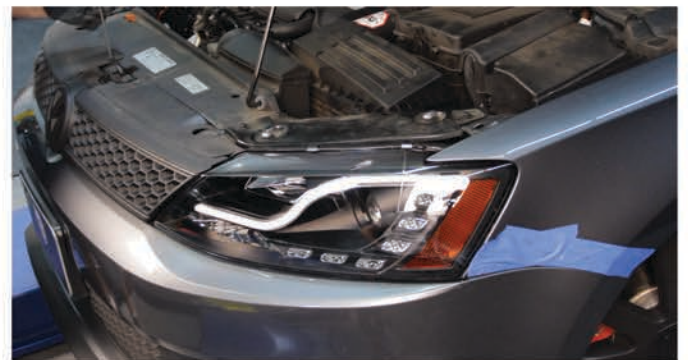
22) Reinstall [4x] T-15 torx screws to secure the grille.