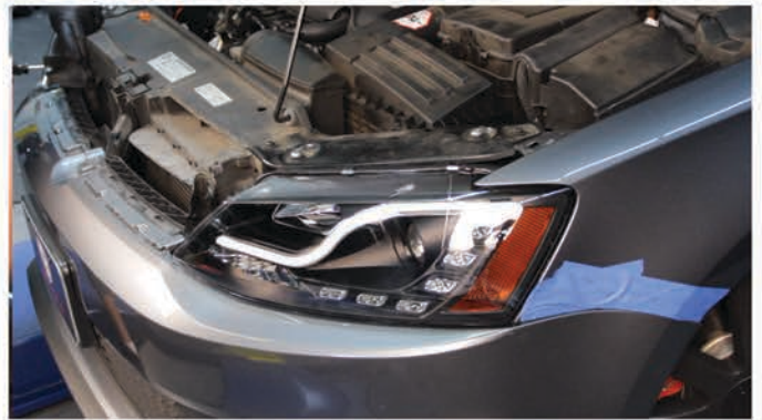
20) Reinstall [3x] T-30 torx screws hidden behind the grille to secure the fascia.