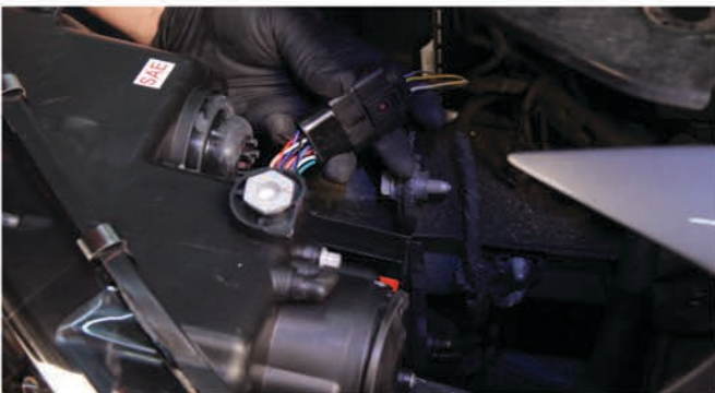
15) Connect the Spyder headlight to the headlight wiring harness.