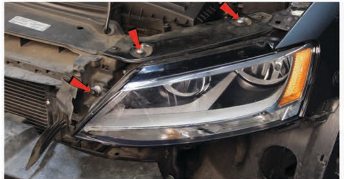
10) Remove [3x] T-30 torx screws securing the headlight.