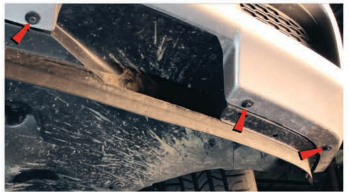
8) Unseat the front bumper fascia by pulling it up to unseat the fascia retainer hooks, then pull the edges out and ease the fascia back.