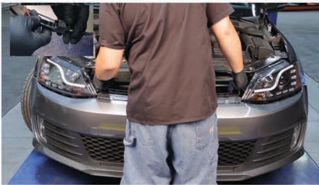
19) Reconnect the fog light harnesses [if equipped], then seat the front bumper fascia into its retaining hooks, then be sure the fascia edges clip properly into place.