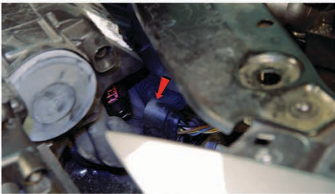
13) Disconnect the headlight wiring harness.