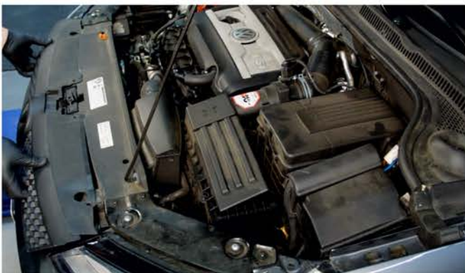
3) Unseat the grille.