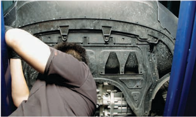
23) Reinstall [6x] T-15 torx screws to secure the fascia to the undertray.