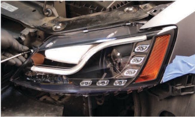
17) Reinstall [3x] T-30 Torx screws to secure the headlight.