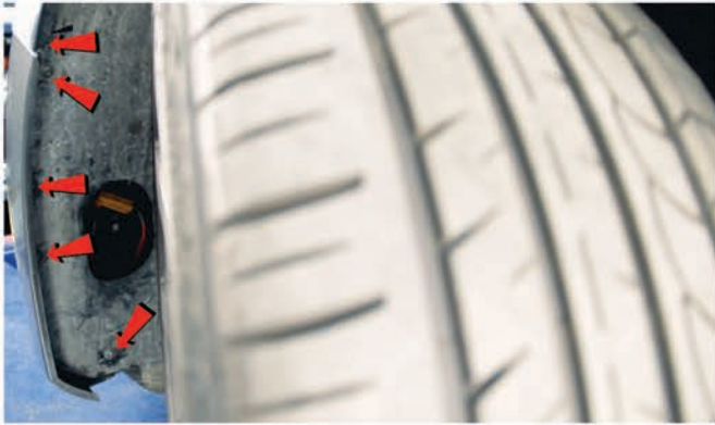
5) Remove [5x] T-15 torx screws securing the fender liner.