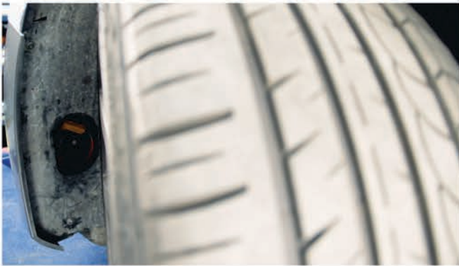
25) Reinstall [5x] T-15 torx screws to secure the fascia to the fender liner in the wheel well.