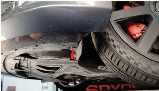
7) Remove [1x] T-15 torx screw securing the bottom corner of the fascia on each side.