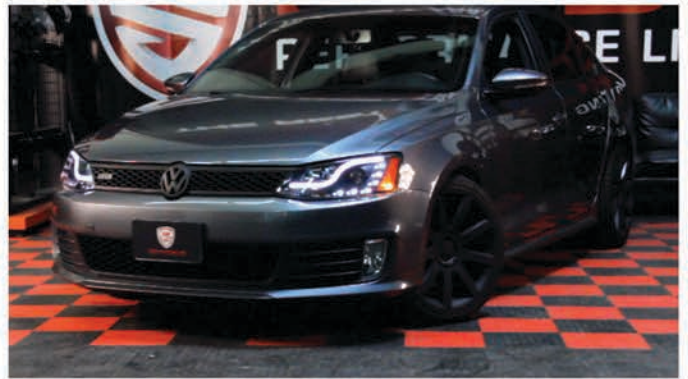
26) Close the hood and enjoy your new Spyder Light Tube projector headlights.