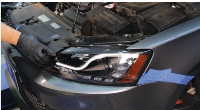
21) Seat the grille.