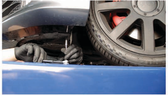
24) Reinstall [1x] T-15 torx screw securing the bottom corner of the fascia on each side.