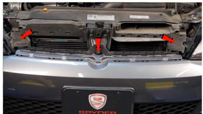
4) Remove [3x] T-30 torx screws securing the fascia behind the grille.