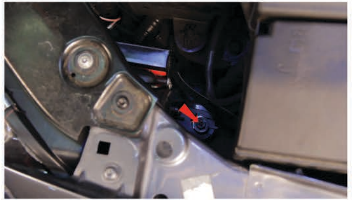
18) Reinstall [1x] T-30 Torx screw hidden behind the core support to secure the headlight.