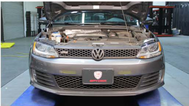
1) Open the hood.

If you are unfamiliar with the installation processes, professional installation is highly recommended.