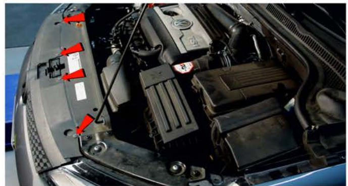
2) Remove [4x] T-15 torx screws.