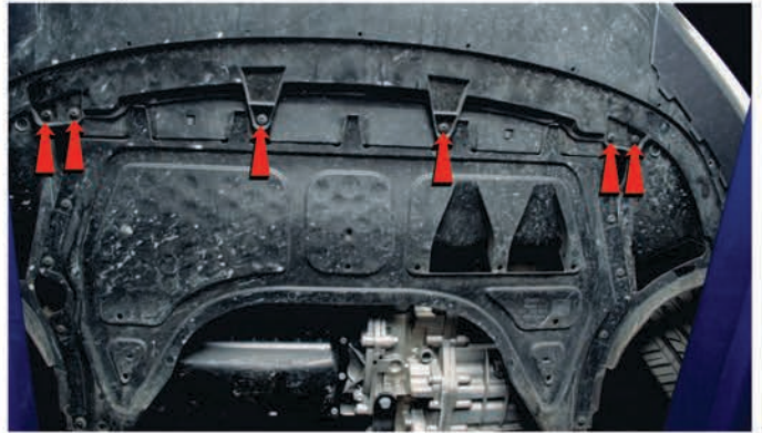
6) Remove [6x] T-15 torx screws securing the fascia to the undertray.