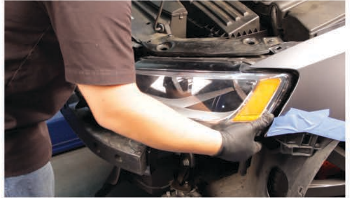
12) Unseat the headlight.