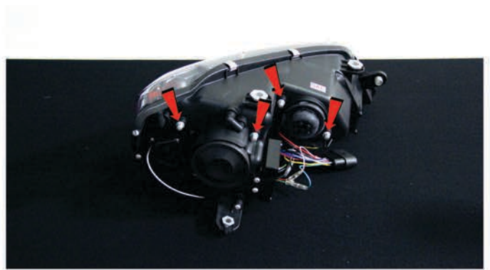
14) Your beam adjusters are shown here and are 8mm. This model headlight is plug and play, no wiring is necessary for the Light Tube or LED DRLs.