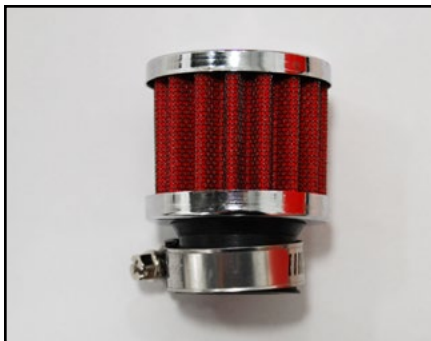
SAI Air Filter w/Clamp