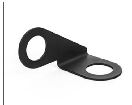
SAI Air Filter Bracket