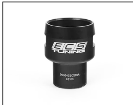
SAI Air Filter Adapter