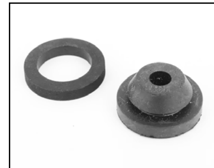
Rubber Spacer & Mounting Grommet*